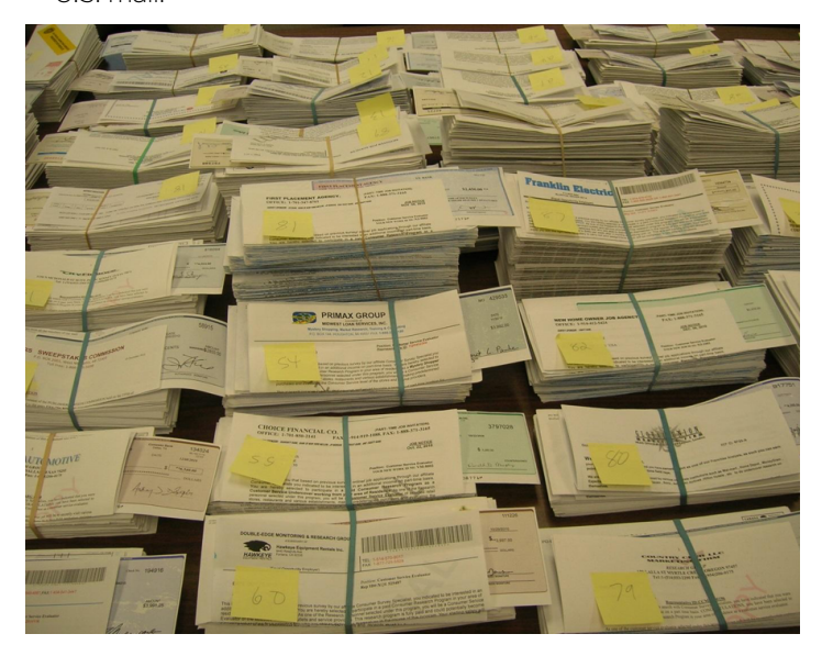
Here is the FTC warning about this type of fraud.

Here is a batch of mystery shopper scam letters the U.S. Postal Inspection Service seized before they could enter the U.S. mail.